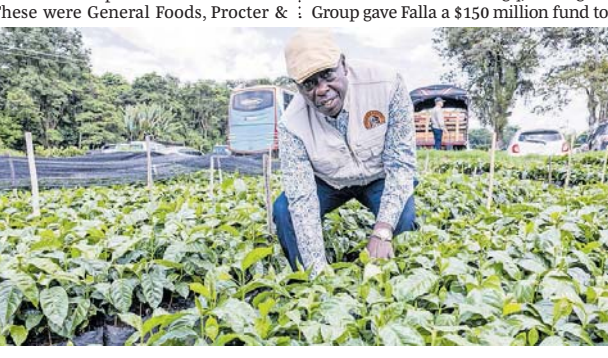
Deputy President Rigathi Gachagua at a coffee farm Chinchina, Caldas State. Colombia last month.

By then, three giants dominated the American coffee sector, accounting for more than 80 per cent of retail sales. These were General Foods, Procter &