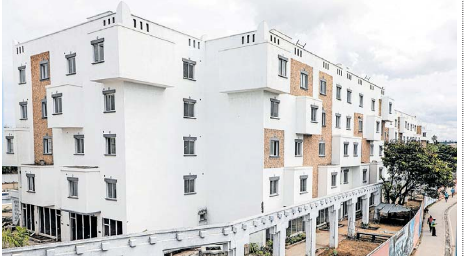
The newly constructed Buxton Point Estate in Mombasa. It may soon be mandatory for owners of residential buildings to install charging facilities for electric vehicles. Below: The Autopax Air Yetu electric vehicle.

In a far-reaching proposal aimed at discouraging the use of fossil fuels in the country, new residential buildings will have to install charging facilities for electric vehicles