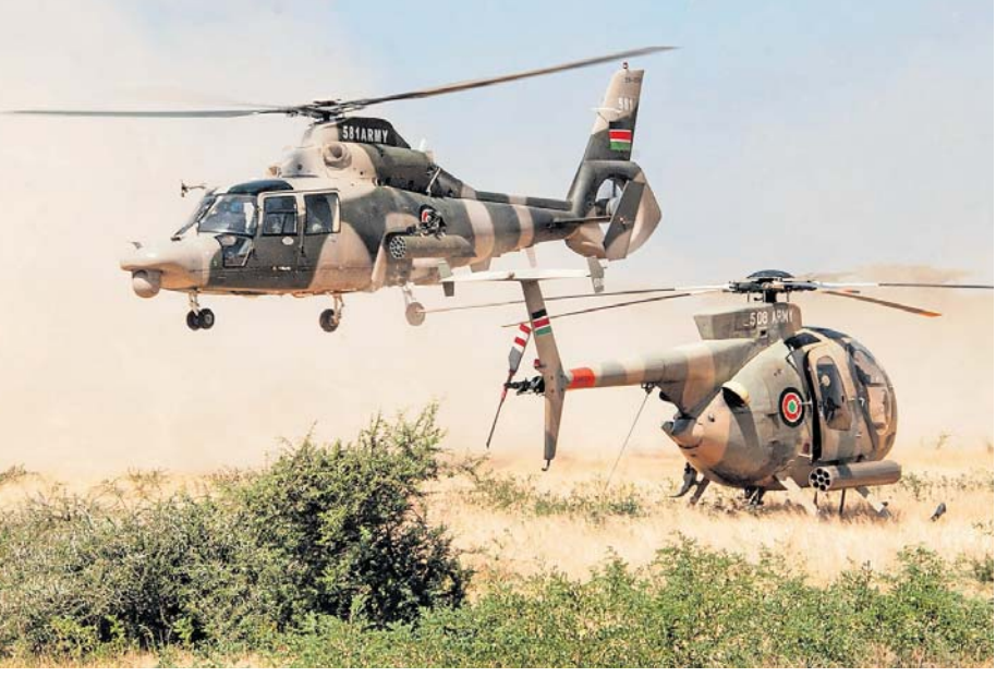
Kenya Defence Forces' combat helicopters during Operation Linda Nchi. The scaling down of the African Transition Mission in Somalia (Atmis) forces was set to enter the second phase in September, but President Hassan Sheikh Mohamud appealed to the United Nations, African Union, United States and European Union to delay the process.

The drawdown of Atmis – which has troops from Kenya, Uganda, Ethiopia and Burundi – has government officials scratching their heads as concerns soar in Nairobi and Mogadishu that Somalia is hurtling towards an Afghanistan-like moment. In Kabul, Taliban jihadists over-